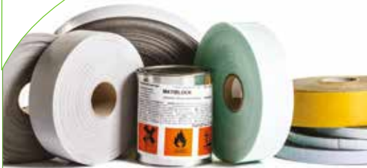
ACCESSORIES FULL RANGE

Special solvent-based glue used to ensure resistance up to 120°C as an alternative to the self-adhesive range of products.