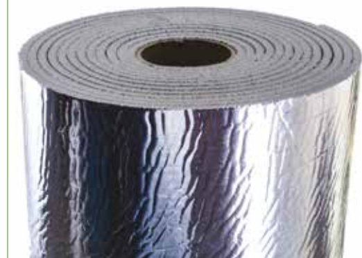
TROCELLEN CL 1 ALU SMOOTH